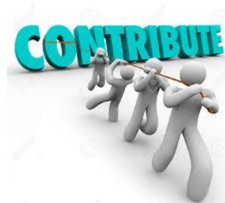
To achieve our common goals