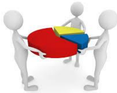
Bring & Share Ideas