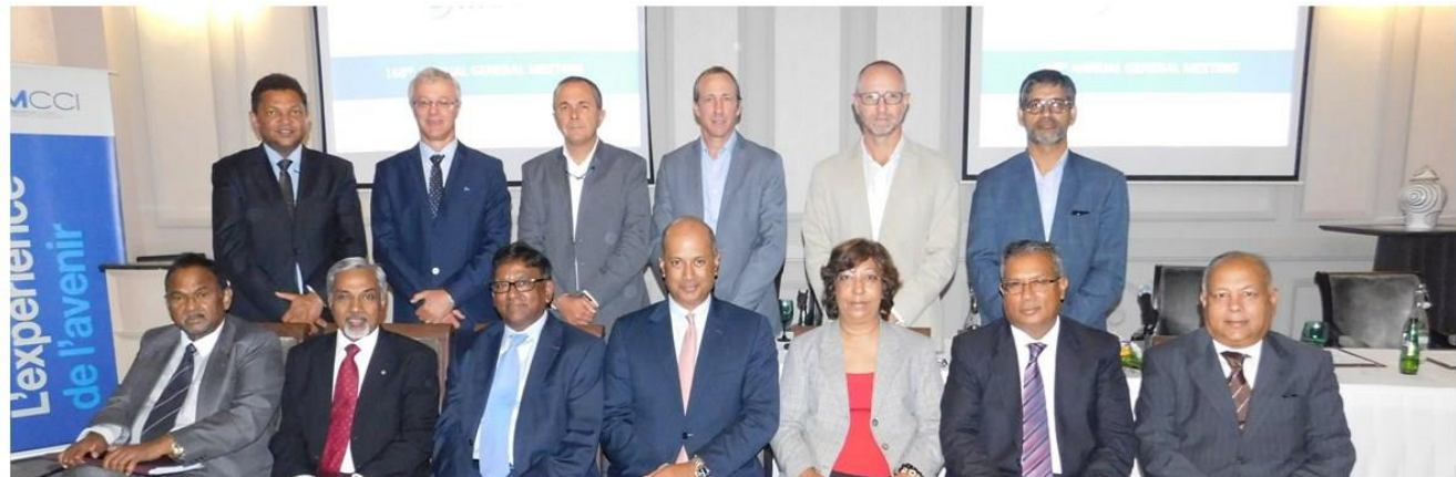
The newly elected MCCI Council

As a member of the MCCI Council, AMFCE has benefited immensely in terms of visibility and recognition both at the national and regional levels. Our membership has also provided the opportunity to our members to have their opinions and contributions taken on board for formulation and implementation of strategic policy level proposals and decisions.